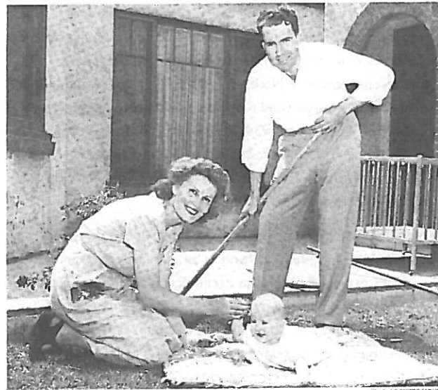
Nixon with his wife Pat and daughter Tricia in the yard of their house in Whittier in 1946