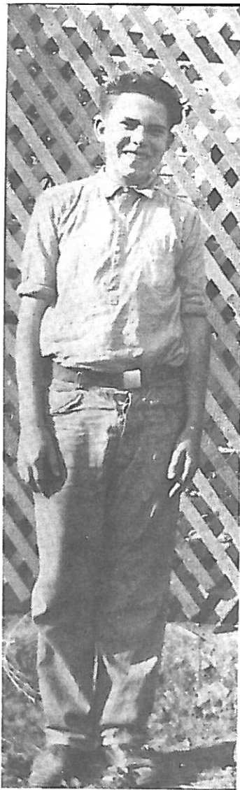
Richard Nixon in East Whittier in 1927