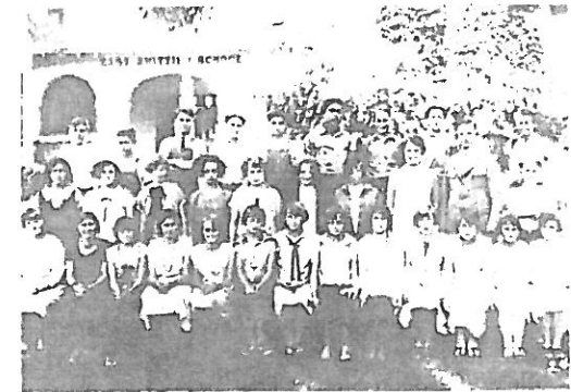
Richard Nixon (back row, fourth from left) with his class at East Whittier Grammar School in approx 1924.