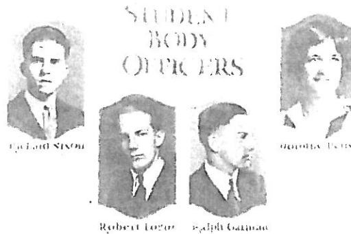
Richard Nixon as a student body officer at Whittier High School in 1930

Nevertheless, Nixon immediately immersed himself at Whittier College, excelling in academics and in athletics. Nixon also involved himself at social functions, including creating a entirely new social club called the Orthogonians, comprised of students of humble origin like himself. Additionally, Nixon was also elected student body president of Whittier, involving and arranging basically every school activity and then graduated 3rd in his class in 1934.